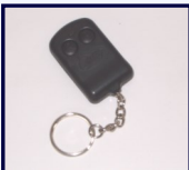
Convenient remote control operation